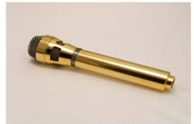
Special Order (handheld microphone)