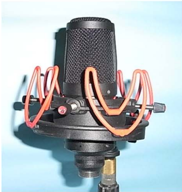
model 359 + Rycote USM-L (Option)

A condenser microphone with revolutionarily natural sounds. It can be modified for various special requirements.